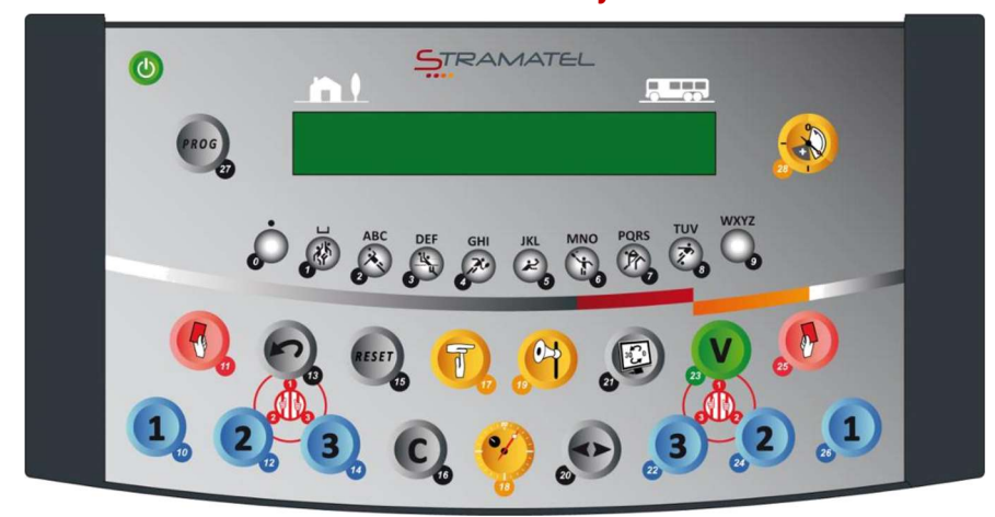
Functions of the main control console - Keys are numbered from 0 to 28